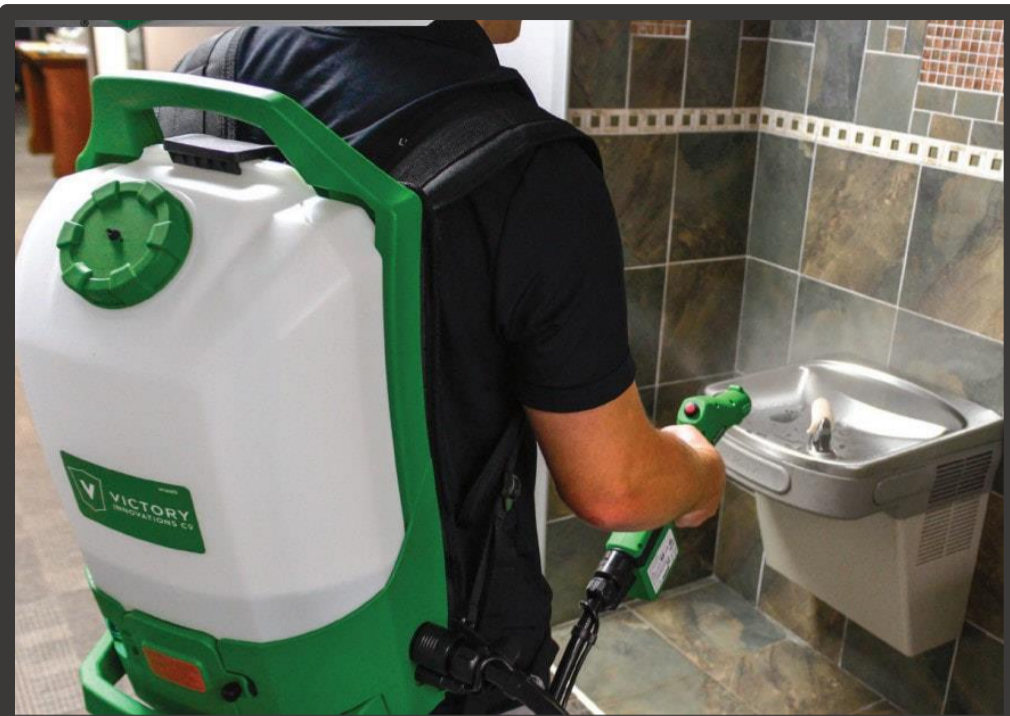
Backpack Electrostatic Sprayer

CBS uses electrostatic technology in the application of disinfectants for germ control. This technology adds a positive electrical charge to the chemical and then atomizes it as it is sprayed creating a magnetic attraction between the spray droplets and the targeted surface. This electrical charge draws the atomized disinfectant where it wraps itself 360° around objects and binds to all surfaces.